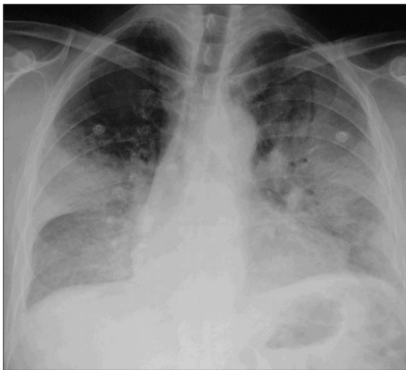
Figure 2: Chest radiograph in a confirmed case of legionellosis with multilobar opacifications.

Control of Legionella , whether environmentally or within institutions, is hampered