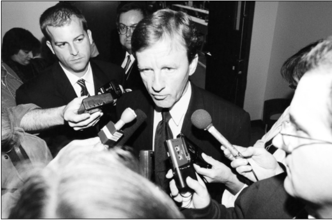
Allan Rock faces media scrum after addressing CMA meeting

“The prime minister and the government have made it clear that when federal expenditures can prudently be increased, health is very much our priority,” Rock said.