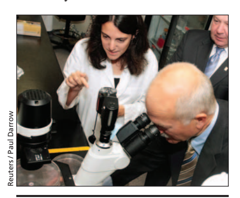
New Democrat leader Jack Layton peers through a microscope.

medical mishaps (CMAJ 2008;179 [4]:309-11, CMAJ 2008;179[5]:407-9 and CMAJ 2008;179[6]:515-7). The Conservatives equated such compensation to "government auto insurance plans," and said that's the domain of the provinces. The Bloc concurred on jurisdictional grounds, while the Liberals and Greens said they'd be "open" to discussions on the issue. The New Democrats were the most amenable to pursuing a no-fault compensation scheme, saying that such a system "offers the best chance of achieving patient safety, patient compensation and physician accountability while protecting physicians financially."