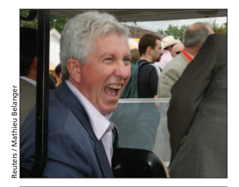
Bloc Québécois leader Gilles Duceppe campaigns in St-Tite, Quebec.

The Liberals and New Democrats support the notion, while the Greens and Bloc side-stepped the issue. The Conservatives said public health is the responsibility of the Health Minister.