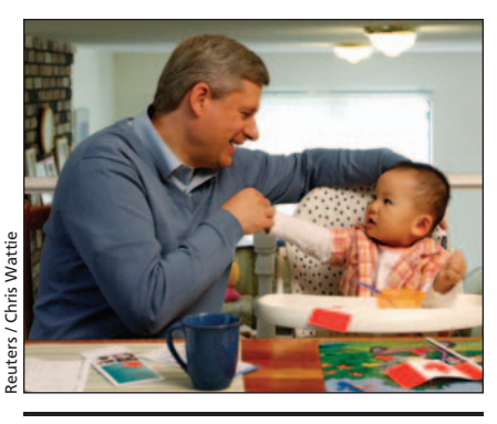
Prime Minister Stephen Harper plays with 14-month-old Eric Huang.

In light of those staggering numbers, it would be reasonable to expect that health care would be a major campaign issue, yet the 5 political parties contending for Oct. 14, 2008, votes have been remarkably silent on health care issues in the early run-up to Canada's 40th general election.