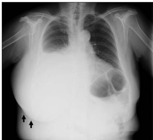
Figure 1: Chest radiograph of a woman showing a right pleural effusion and severe swelling over her right chest wall (arrows).

A 72-year-old woman with a history of hypertension presented with progressive swelling of the right posterior chest wall that had been present for two days following a diagnostic thoracentesis. She had developed progressive dyspnea two weeks before presentation, and had been assessed elsewhere. A chest radiograph taken at that time had shown a massive pleural effusion on the right, and a diagnostic thoracentesis had been performed under ultrasonographic guidance with a 1.88-inch 18-gauge needle. The patient had noticed the swelling of her chest when she arrived home. She did not develop fever, chills, cough or worsening dyspnea following the procedure.