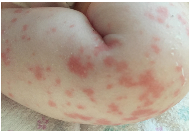
Figure 2: Photo of erythematous maculopapular rash on the left lower limb of an eight-day-old infant who had a water birth. The rash became generalized over four days.

Consequently, therapy was changed to piperacillin-tazobactam, and azithromycin was continued while we waited for the Legionella cultures, even though urine antigen testing for Legionella was negative. The cultures returned positive for Legionella pneumophila serotype 6 and we added rifampin for synergy. Improvements in ventilator settings were noted within 48 hours after azithromycin was started, and our patient was successfully extubated after having required mechanical ventilation for five weeks. At two months of age, she was discharged on home oxygen with close follow-up. Testing of the birthing water to confirm the source of Legionella infection was not possible, as the tub had been emptied and disinfected.