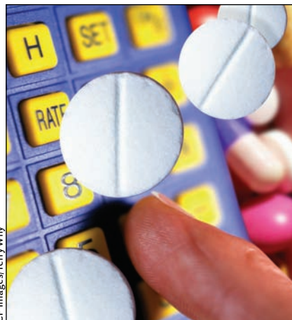
Pricing of generic drugs in Canada under review.