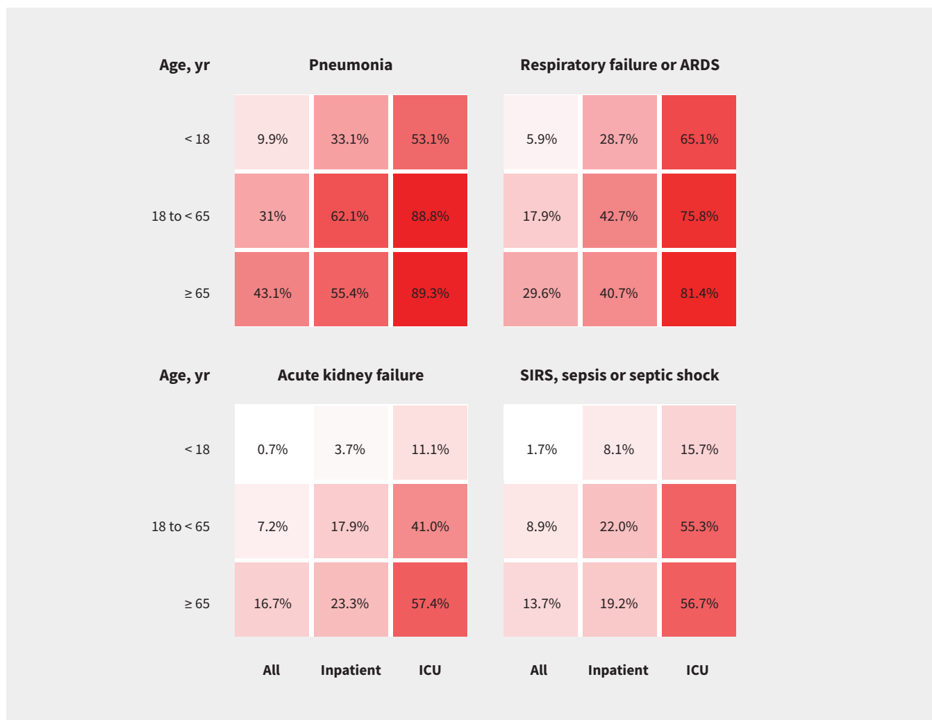
Figure 4: Risk estimates of the most common complications of coronavirus disease 2019 (COVID-19), by age and hospital admission status. Some of these conditions are composites of more than 1 International Classification of Diseases, 10th Revision, Clinical Modification (ICD-10-CM) header code. Pneumonia: defined as J12 (viral pneumonia, not elsewhere classified) or J18 (pneumonia, unspecified organism). Respiratory failure or acute respiratory distress syndrome (ARDS): defined as J96 (respiratory failure, not elsewhere classified) or J80 (acute respiratory distress syndrome). Acute kidney failure: defined as N17 (acute kidney failure). Systemic inflammatory response syndrome (SIRS), sepsis or septic shock: defined as A41 (other sepsis) or R65 (symptoms and signs specifically associated with systemic inflammation and infection). Complete data for these findings are provided in Appendix 1, eTable 6 (available at www.cmaj.ca/lookup/doi/10.1503/cmaj.201686/tab-related-content ).

help providers, patients and policy-makers understand the likelihood of complications. For example, acute myocarditis was found to have an OR of 8.17 but an overall risk of 0.1%, illustrating how a very strong association of a condition with COVID-19 does not necessarily translate into a high overall risk.