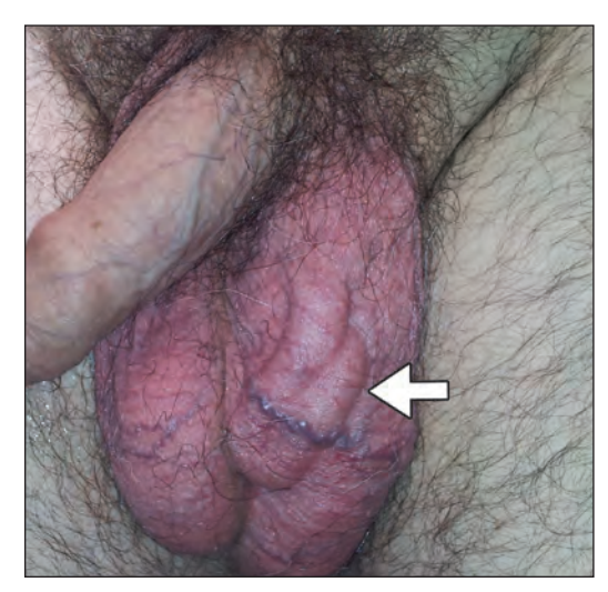
Figure 1: Left-sided varicocele (arrow) that developed suddenly in a 52-year-old man.

See related practice article by Forster and Biyani at www.cmaj.ca/lookup/doi/10.1503/cmaj.121445